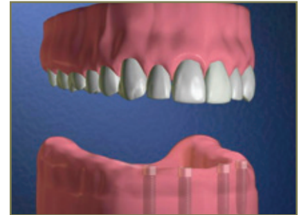
Implants in lower jaw